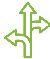
Multiple learning formats - online, workshops or blended