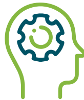
ASFA Policy Team knowledge