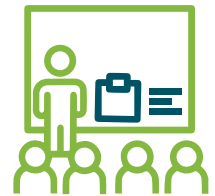
Industry leading workshops and courses